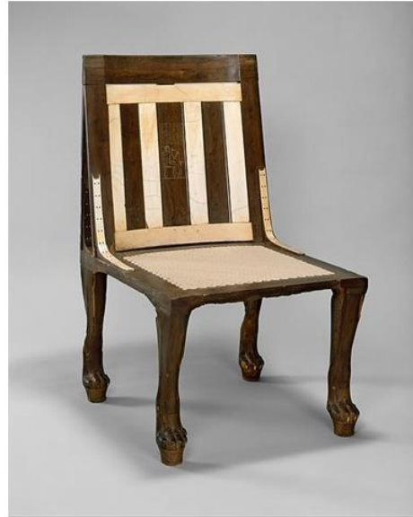
Figure 4. Chair of Reniseneb , ca. 1450 B.C. (Metropolitan, 2015)