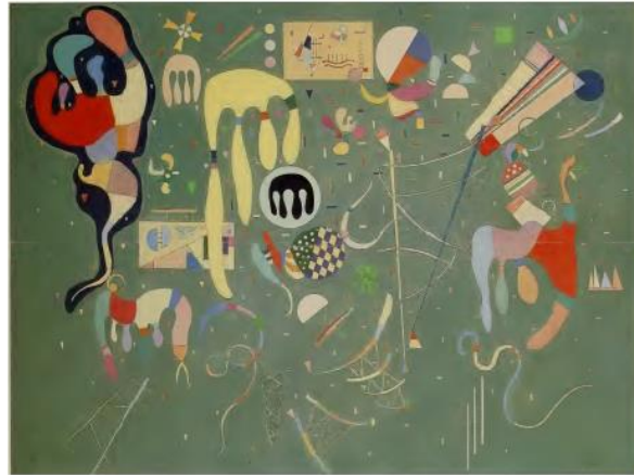
Figure 1. Kandinsky's Actions Variées (Krens et al. 1990, p. 107)