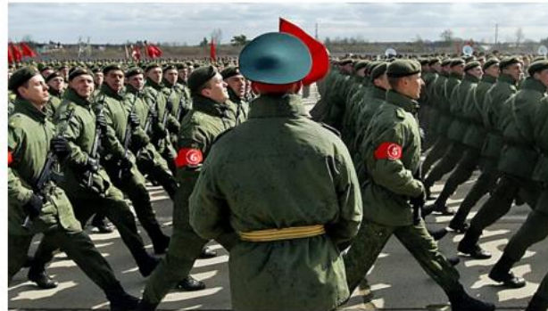
Figure 2. Russian soldiers march for the Victory Day Parade (Stewart, 2015)